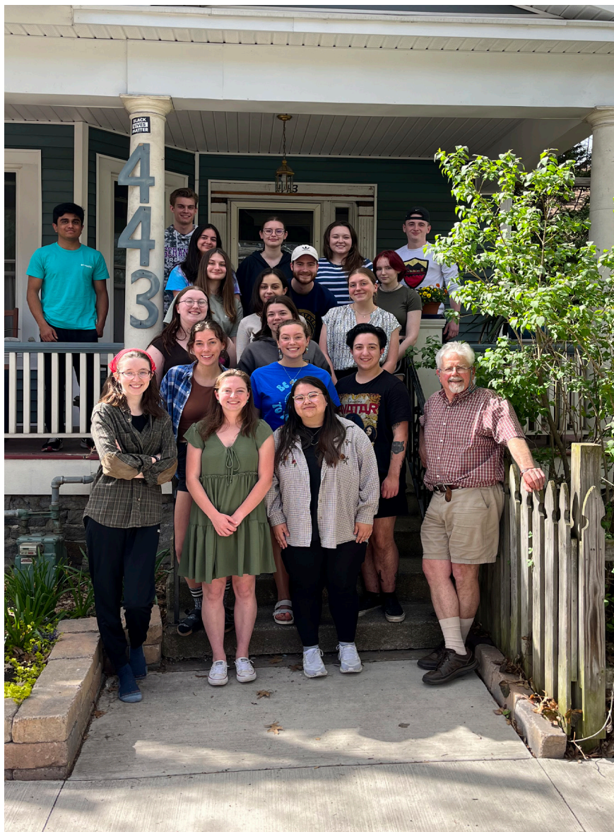
Esprit Staff Spring 2023