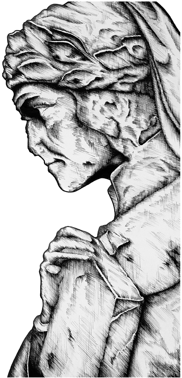
Dante Outside of Alumni - Max Messenger