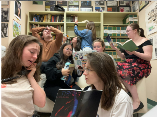
Esprit Production Team 2023