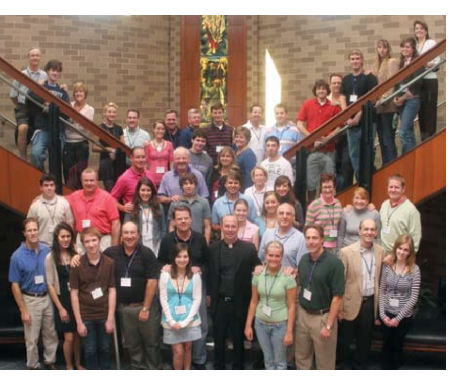
Many alumni parents and their students who are members of the Class of 2011 gathered for this legacy photo during Family Weekend, Sept. 28-30.

Among many of our alumni, a Scranton education is a family tradition. This fall, 63 daughters and sons of Scranton alumni entered the University as undergraduate students. Their parents and, in some cases, grandparents are among the 40,000 alumni who have chosen Scranton for their education. At right are the members of the Class of 2011 who are following in the footsteps of their parents who are Scranton alumni.