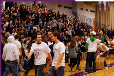
“School spirit is back!”

“...we hope that we can make a difference on campus this year and see a permanent improvement to school spirit in the future.”