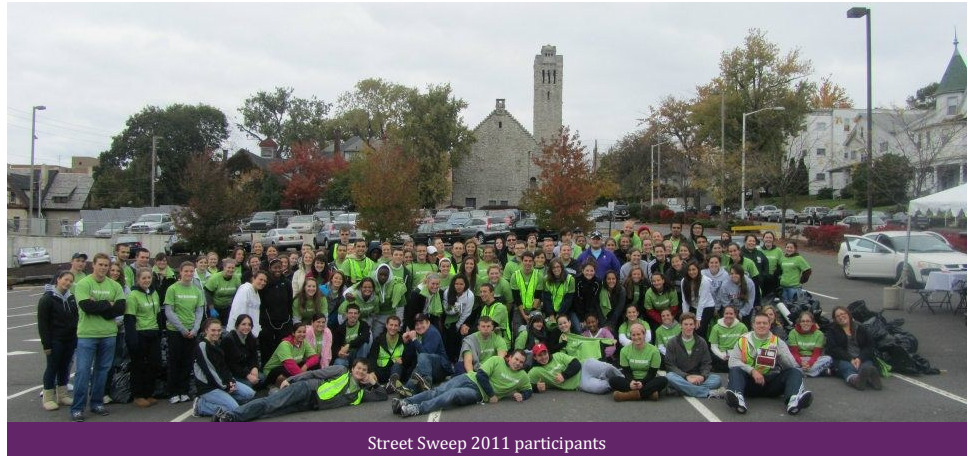
Street Sweep 2011 participants

This year's Street Sweep had a new idea in mind, sustainability. The recycling initiative that was started this year