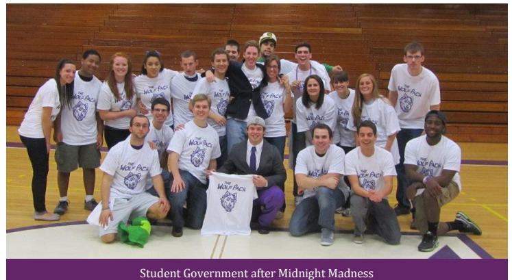
Student Government after Midnight Madness

Each student provided a non-perishable food item for the Community Outreach Thanksgiving Food Drive as admission to the event. Upon leaving,