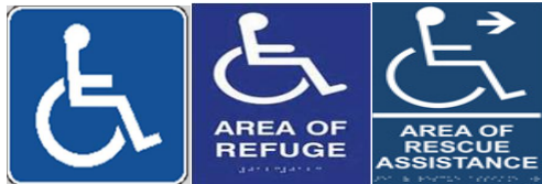
Typical Area of Rescue Assistance, International Sign of Accessibility, and “Area of Refuge” Signs