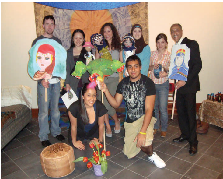
Cast and puppets in the Moroccan sitting room.