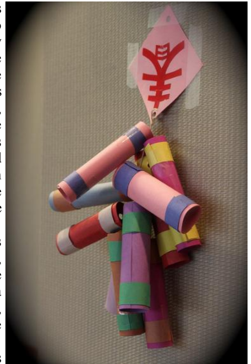
Firecrackers, accompanied by the symbol for the Spring that is coming.